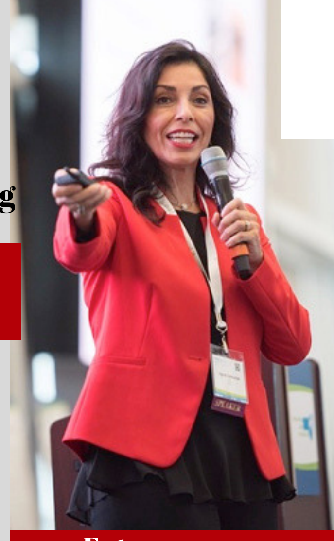
Entrepreneuer TV Host

Leadership is influencing others to act without them knowing it. Leadership is about compassion, hard work, dedication, and tireless enthusiasm for what you're doing and for the people you're doing it with. A leader challenges, mediates, motivates, communicates and inspires. Sometimes with a shout and sometimes with a whisper.